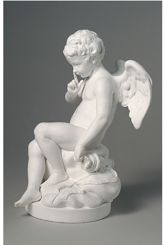
Etienne-Maurice Falconet, L'Amour menaçant (Threatening Love) , 1758/61. Manufacture de Sèvres. Soft-paste porcelain biscuit. Manufacture et Musée nationaux, Sèvres, MNC 27724.1.