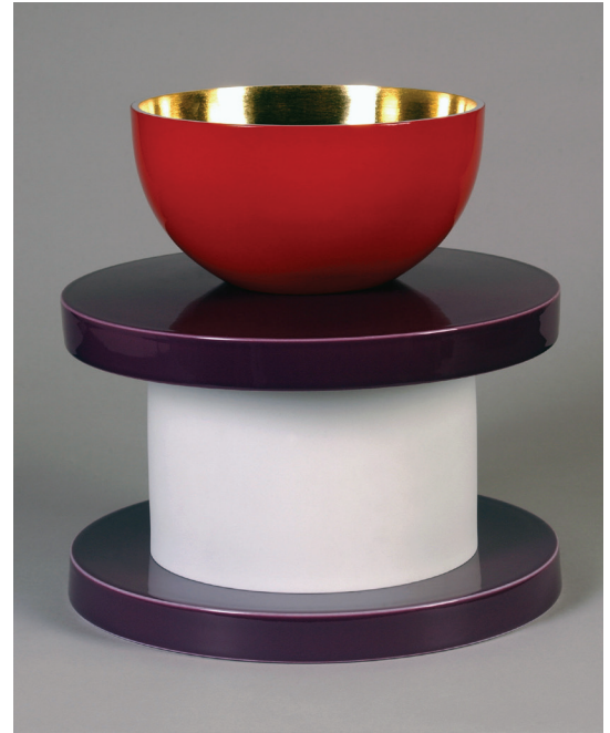
Ettore Sottsass, Vase Diane , 1994/96. Glazed and decorated pâte nouvelle porcelain. Manufacture et Musée nationaux, Sèvres, 2011.D.3316.