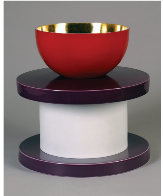
Ettore Sottsass, Vase Diane , 1994/96. Glazed and decorated pâte nouvelle porcelain. Manufacture et Musée nationaux, Sèvres, 2011.D.3316.