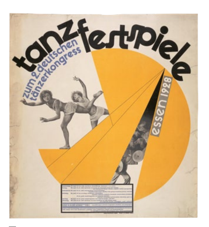
Max Burchartz. Tanzfestspiele zum 2. Deutschen tänzerkongress Essen 1928 (Dance Festival at the Second German Dance Congress) poster, 1928. Printed by F. W. Rohden, Essen. Photolithograph. The Museum of Modern Art, New York, Purchase Fund, Jan Tschichold Collection. © 2018 Artist Rights Society (ARS), New York / VG Bild-Kunst, Bonn.

While writing the landmark book Die neue Typographie (1928), Tschichold, one of the movement's leading designers and theorists, contacted many of the foremost practitioners of the New Typography throughout Europe and the Soviet Union and acquired a selection of their finest designs. A substantial portion of his collection, including work by El Lissitzky, Kurt Schwitters, László Moholy-Nagy, and Herbert Bayer, now in the collection of the Museum of Modern Art, will be displayed together for the first time.