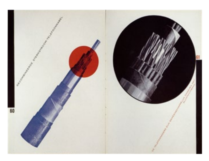
Piet Zwart. NKF: N.V. Nederlandsche Kabelfabriek Delft, 1928. Letterpress and photolithograph, The Museum of Modern Art, Jan Tschichold Collection, Gift of Philip Johnson. © 2018 Artist Rights Society (ARS), New York / VG Bild-Kunst, Bonn.

exhibition includes an overview of Tschichold's career, from his early training in calligraphy and "Blackletter" through his modernist work in the "new typography." There will also be examples of his later designs for Penguin Books in London where he established one of the most famous house styles for a mass-market publisher. A highlight of the exhibition will be a selection of Tschichold's film posters for Phoebus Palast in Munich in 1927, then the largest cinema in Germany, which were often produced at a few day's notice but succeeded in establishing a new approach to film promotion.