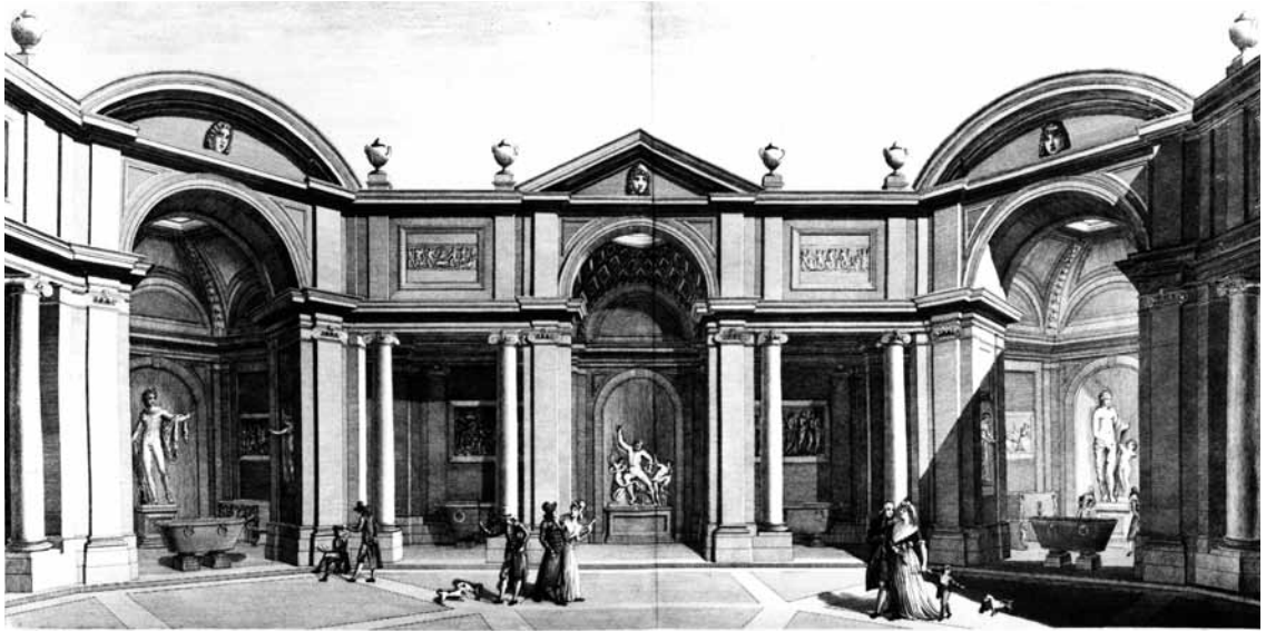
Corte del Museo Pio-Clementino che adorna il Cortile nel Museo Pio-Clementino