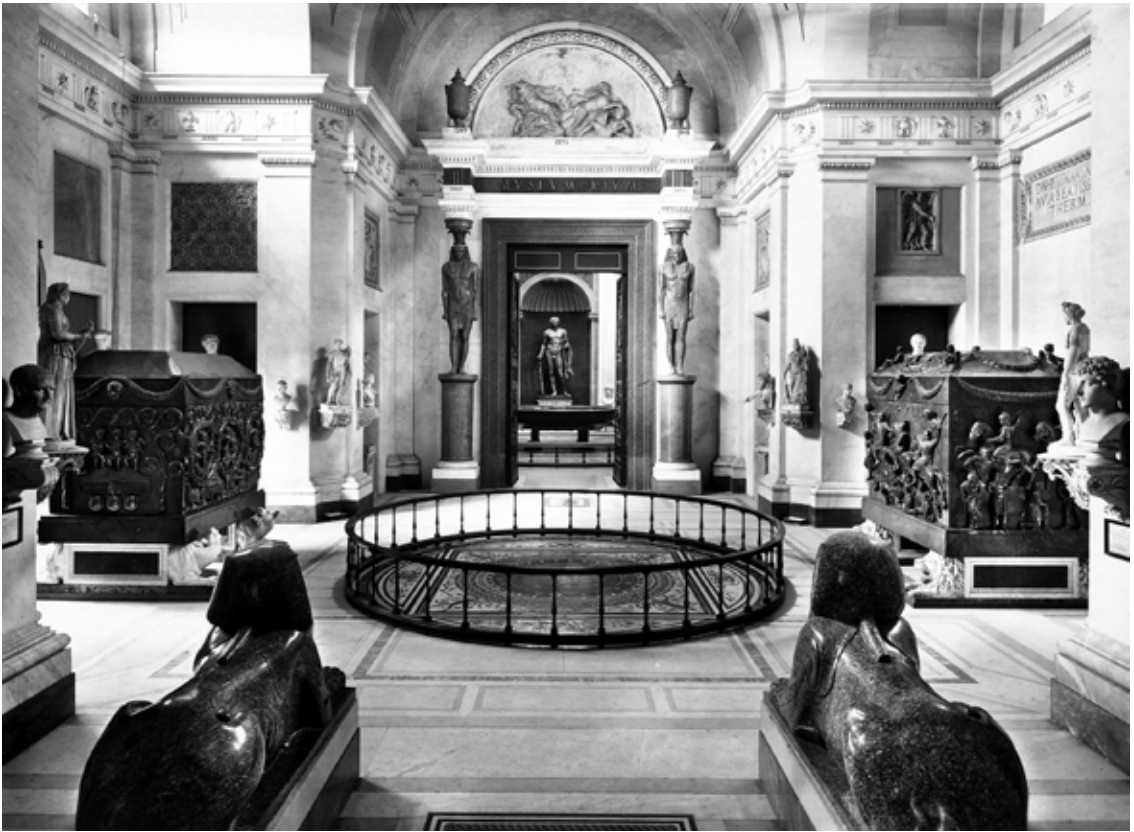
FIGURE 4-5. View of the Greek Cross Atrium in the Museo Pio-Clementino, Rome, late 19th–early 20th century. The view of the room, planned by Michelangelo Simonetti in 1776, shows the Hadrianic telamones (the “Cioci”) acquired in 1779, the mosaic from the Villa della Rufinella restored between 1778 and 1780, the porphyry sarcophagi of Saints Helena and Constantina, added in 1786 and 1790, and the sphinxes restored by Francesco Antonio Franzoni in 1787.

data: Goethe brought along the latest edition of Winckelmann’s Geschichte der Kunst des Alterthums (History of the art of antiquity) so he could read it in the octagonal court, “on the spot where it was written.” 41