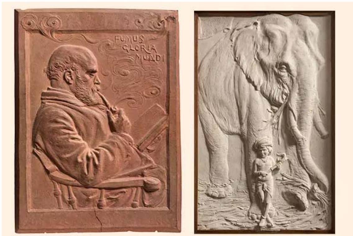
'Fumus Gloria Mundi' self-portrait (c1890); 'Toomai of the Elephants' (c1897)

ornate temporary constructions, as much devoted to promoting international commerce, and the gospel of empire, as to aesthetics — took place across the world as well as in Indian cities; Kipling organised no fewer than 28 of them in his career, from Glasgow and Calcutta to Melbourne.