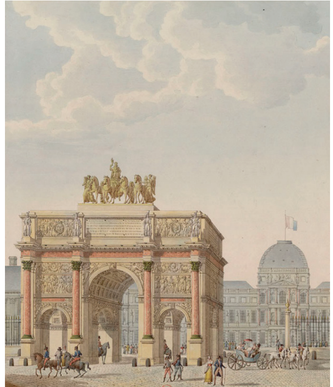
Charles Percier and Pierre Fontaine. Arc du Carrousel, south side view, 1806-15. Watercolor and pen. Bibliothèque nationale de France, département Estampes et photographie, RESERVE FOL-VE-53 (C).

At the beginning of the nineteenth century Napoleon engaged Percier and Fontaine to execute one of the most ambitious projects of his reign and of their careers—linking the Louvre and Tuileries palaces.