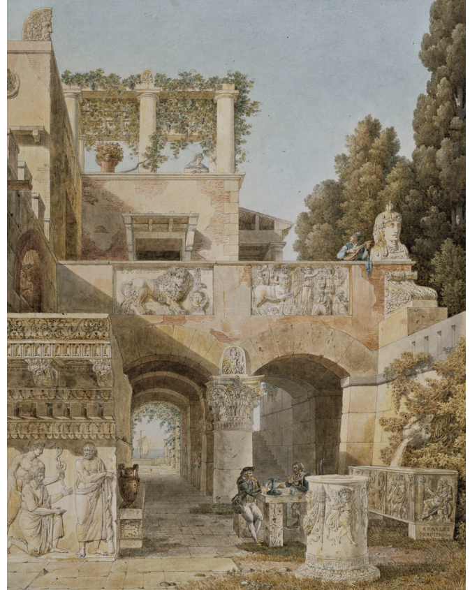
Charles Percier. Italian villa at the seaside , 1797. Pencil, pen, black and brown ink, black chalk, watercolor on paper. Musée du Louvre, Paris, RF3994.

Percier’s Italian sojourn (1786–91) had a profound effect on him. Like many fellowship students at the French Academy in Rome, his stay there was characterized by enthusiasm and wonder, but, more than any other, he made this experience a key moment in his