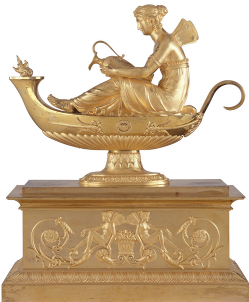
Andiron with Psyche. Made by Pierre Phillippe Thomire after design by Charles Percier, 1809. Chased and gilt bronze, château de Fontainebleau, inv. F 943 C

Charles Percier: Architecture and Design in an Age of Revolutions breaks with the tradition of considering Percier and Fontaine together. This choice, shaped by