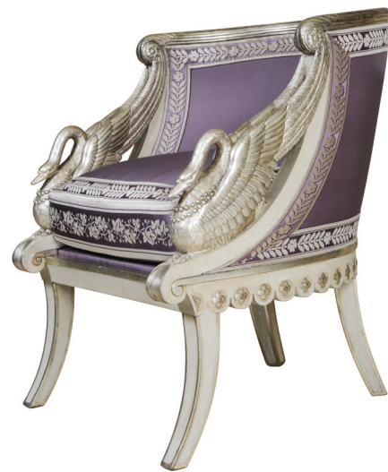
Jacob-Desmaller, after Charles Percier. Gondola chair from the Salon d'Argent of the Elysée Palace, 1805. Carved and silver gilt wood. Palais de l'Elysée, Paris, Mobilier national, GME 18590