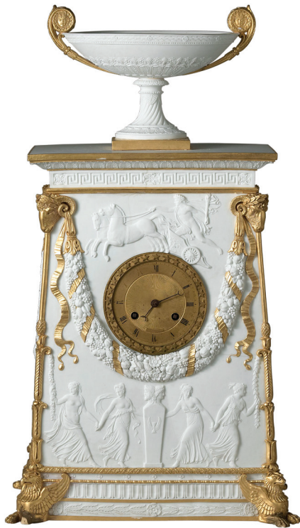
Charles Percier. Clock. Made by Sèvres Porcelain Manufactory, 1813. Bisque porcelain, gold highlights. Sèvres, Cité de la céramique, MNC 13022.

As Fontaine acknowledged himself, the Recueil was Percier's masterwork. Percier drew and engraved the plates largely on his own, despite including both of their signatures. "Percier and Fontaine" is thus perhaps more akin to a luxury brand than an indication of shared artistic paternity. Separating Percier from Fontaine, this exhibition restores Percier's role and singular contribution to the decorative arts as an expert draftsman and designer.