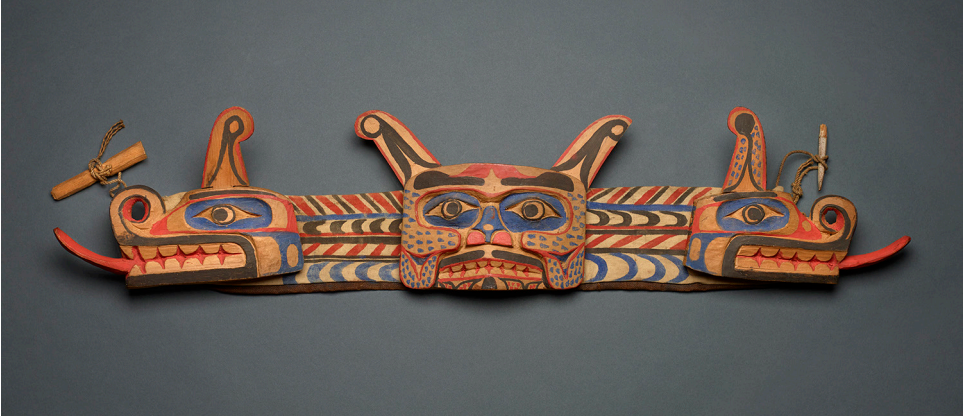
Figure 4. Ceremonial belt worn by a dancer at the Chicago World's Fair, unknown Kwakwaka'wakw maker. Accessioned by the Field Columbian Museum in 1897. Wood, textile, paint, iron alloy, cordage. Courtesy of The Field Museum, Image No. A115416d_003, Cat. No. 18863. Photograph by John Weinstein.

Rupert. A before and after feature allows the viewer to swipe between the original photos and the plates modified for the book, an effective demonstration of the constructed nature of many such illustrations. Some plates are shown to be composite scenes painted from multiple (often unrelated) photo sources. The display succinctly pulls the curtain back on the common artifice of ethnography, and while the constructed nature of certain aspects of the discipline and its photographic documentation has been well rehearsed, the implications have yet to be fully digested. To prove this point, the second gallery closes with a consideration of the impact of Boas and Hunt's research on museums' displays over time. Black-and-white images of Boas, posing for photographs on which to base his well-known Hamat'sa life group, are projected next to a wall-sized photo-reproduction of the diorama. Didactic material breaks down the diorama's elements and its making, and Boas's ghostly form seems to haunt the legacy of the many institutions that reproduced his displays, as demonstrated by a section that is aptly titled "Afterlives in the Museum."