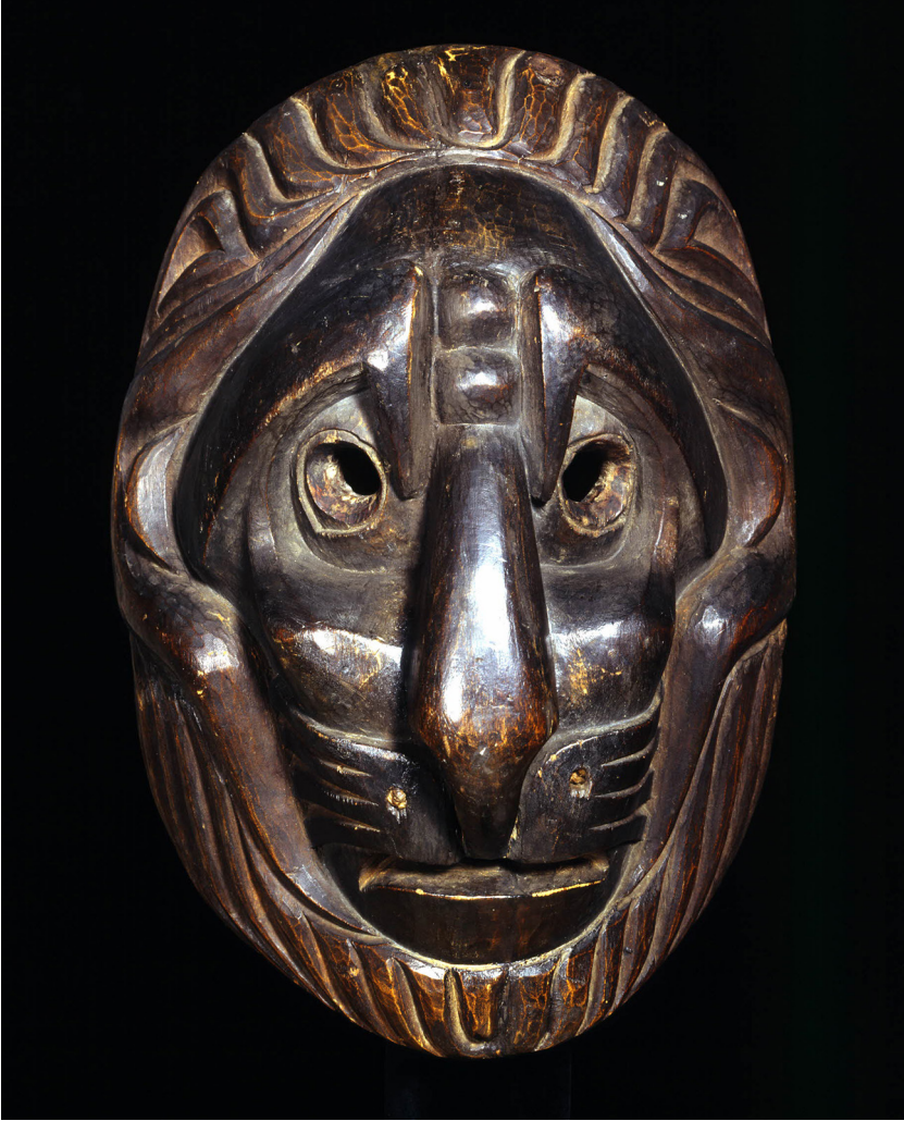
Figure 3. Lion-type Mask, unknown Kwakwaka'wakw maker, 1820–70. Painted (?), carved wood. Courtesy of the Trustees of the British Museum, Am +.436.

depict Sepa'xais (Shining Down Sun Beam), a sky dweller associated with the villages of Quatsino Sound. Boas's own reading of masks and crests relied on formal typologies (in this case, leonine features and a twisted rim motif) that divorced aesthetics from the lived politics of the hereditary relationships, downplaying the notion of masks as cultural property with associated lineages of ownership. Hunt's notes demonstrate how similar-looking objects can have distinct meanings, names, and