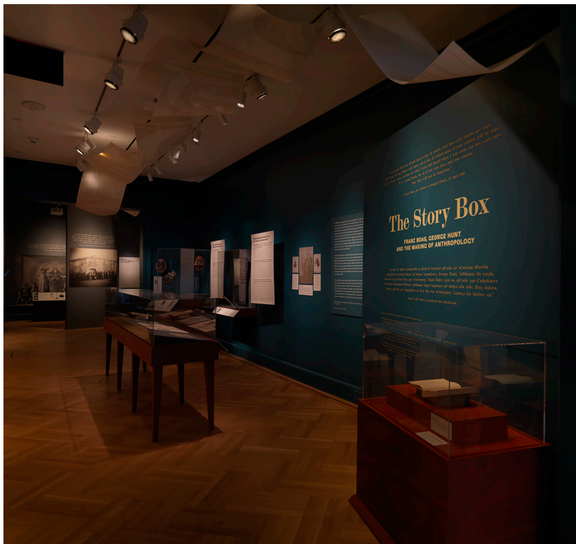
Figure 1. Installation view of Story Box: Franz Boas, George Hunt, and the Making of Anthropology , Bard Graduate Center Gallery, February 14 to July 7, 2019.

a transparency of the anthropological process and a reversal of its hierarchies. By uncovering the layers of dispersed archives that constituted the production of Social Organization , the exhibition and larger project pursue the reconnection and reactivation of the culture knowledge that fills the gildas , or “box of treasures,” of the specific Kwakwaka’wakw families and communities with whom Hunt and Boas worked and from whom they learned.