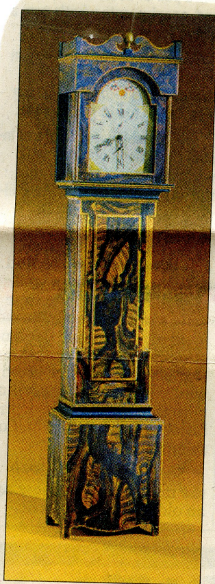
Crafted in the 1830s, during the same time Shaker pieces were being produced, this painted clock comes from "The Fancy World."

Such opportunities for unfettered expression weren't numerous, but they did exist. Impassioned hymn-singing