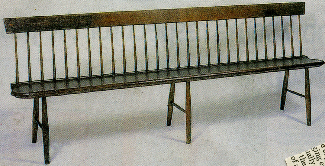
The very long, lean wooden Shaker settee is stronger than it looks.