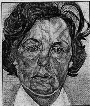
A THATCHED COTTAGE by Rembrandt, circa 1650, pen and ink; below, a portrait of Deborah, Dutchess of Devonshire, 1956-57, by Lucian Freud

thing of a clan revival. He and his wife are patrons of the arts, commissioning family portraits by Lucian Freud and purchasing other notable paintings by 20th century British artists.