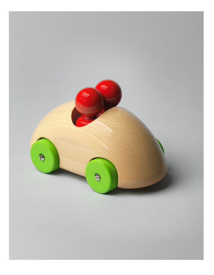
Ulf Hanses for Playsam. Streamliner Rally, introduced 1984. Wood, metal. Private collection.

In eighteenth- and nineteenth-century Sweden, wooden toys were the ordinary amusements of the poor. Carving small animals from the plentiful resource of wood was a traditional occupation for rural Swedes. By the midnineteenth century, as the cult of childhood innocence surged, the Swedish toy industry produced wooden animals, carts, dolls, sleds, and furniture for a rapidly growing domestic market.