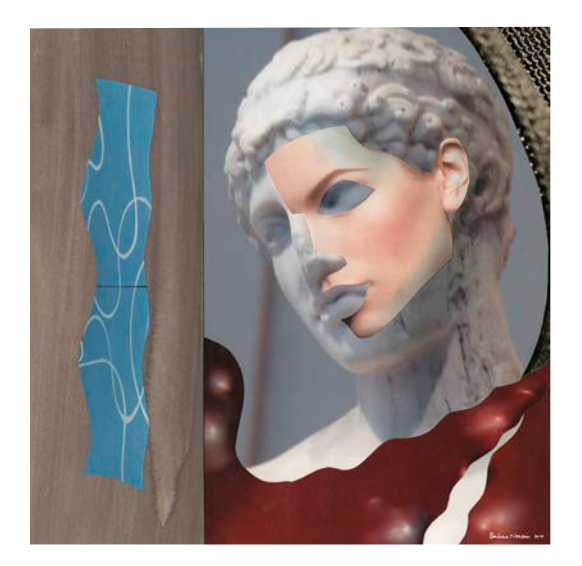
Barbara Nessim. Sea Pearl, from the series Chronicles of Beauty, 2010. Digital print on aluminum.

In recent years, Nessim has made increasing use of collage in many of her most powerful works, which often employ digital techniques as well. The last section of the exhibition features the original artwork for The Model Project (2009), plus larger digital prints on aluminum, such as Ancient Beauty (2009). Collages for Chronicles of Beauty (2010) are also on view, alongside some of the finished printed works.