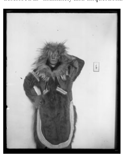
Model in "Eskimo" hide, fur, and sinew coat, ca. 1916.

During the next decade, Stehli Silk Co. and H. R. Mallinson & Co. produced silk prints designs such as "Inca" and "Shoshoni Tribe," respectively, based on artifacts in the AMNH ethnographic collections. These silk prints trumpeted the movement's legacy into the late 1920s and championed a style that was at the time described as "intimately and unquestionably our own."